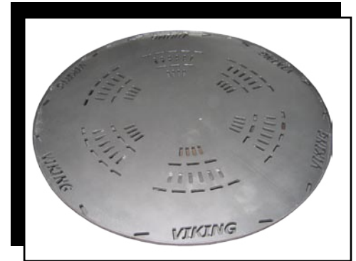
Viking Table Blast Systems offer a table lined with a self-draining, 1/2" thick manganese alloy plate

It is in the customization of our basic designs to your parts specific needs that truly sets Viking apart from the competition. With an accomplished and proven design staff, Viking can build equipment from the ground up or simply modify existing models to tailor fit your cleaning application. At Viking we do not simply match your part to the closest machine size that will work. We match our blast equipment to your part, to provide the most efficient and economical cleaning solution possible.