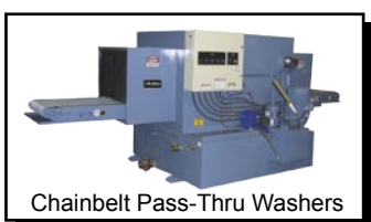
Chainbelt Pass-Thru Washers