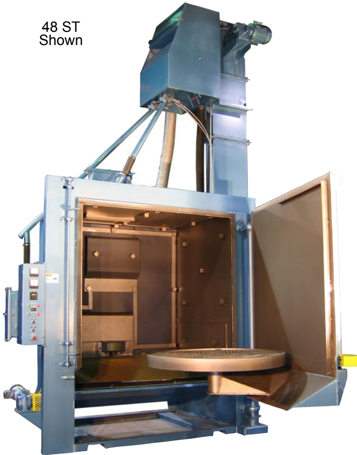
48 ST Shown