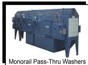
Monorail Pass-Thru Washers

VIKING BLAST AND WASH SYSTEMS RESERVES THE RIGHT TO CHANGE ITS PRODUCTS OR SPECIFICATIONS AT ANY TIME WITHOUT NOTICE OR OBLIGATION.