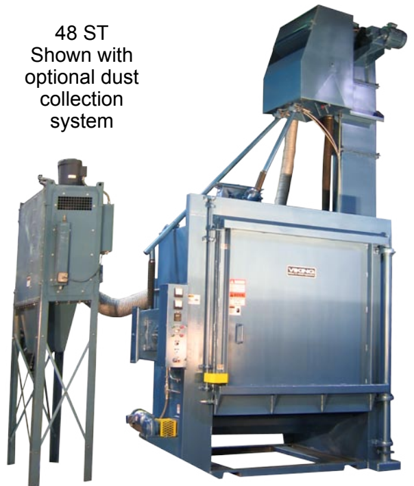
48 ST Shown with optional dust collection system